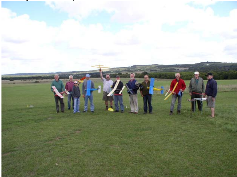
Tomboy 36 Fly-off