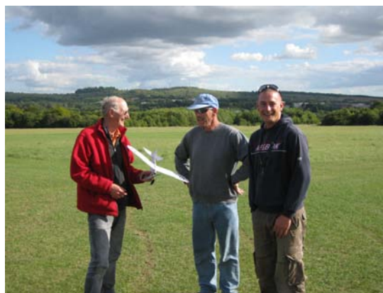
Emwanezer, Cox 020 power + recovery team!