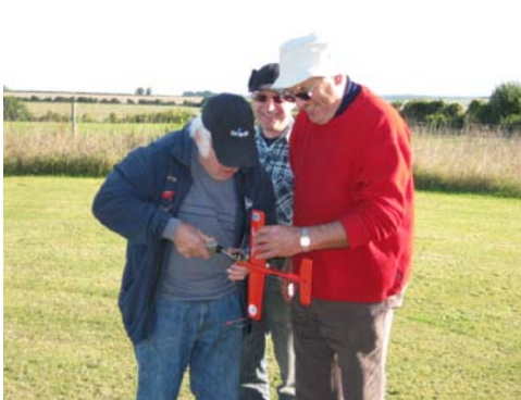
Preparations for the fly-off.